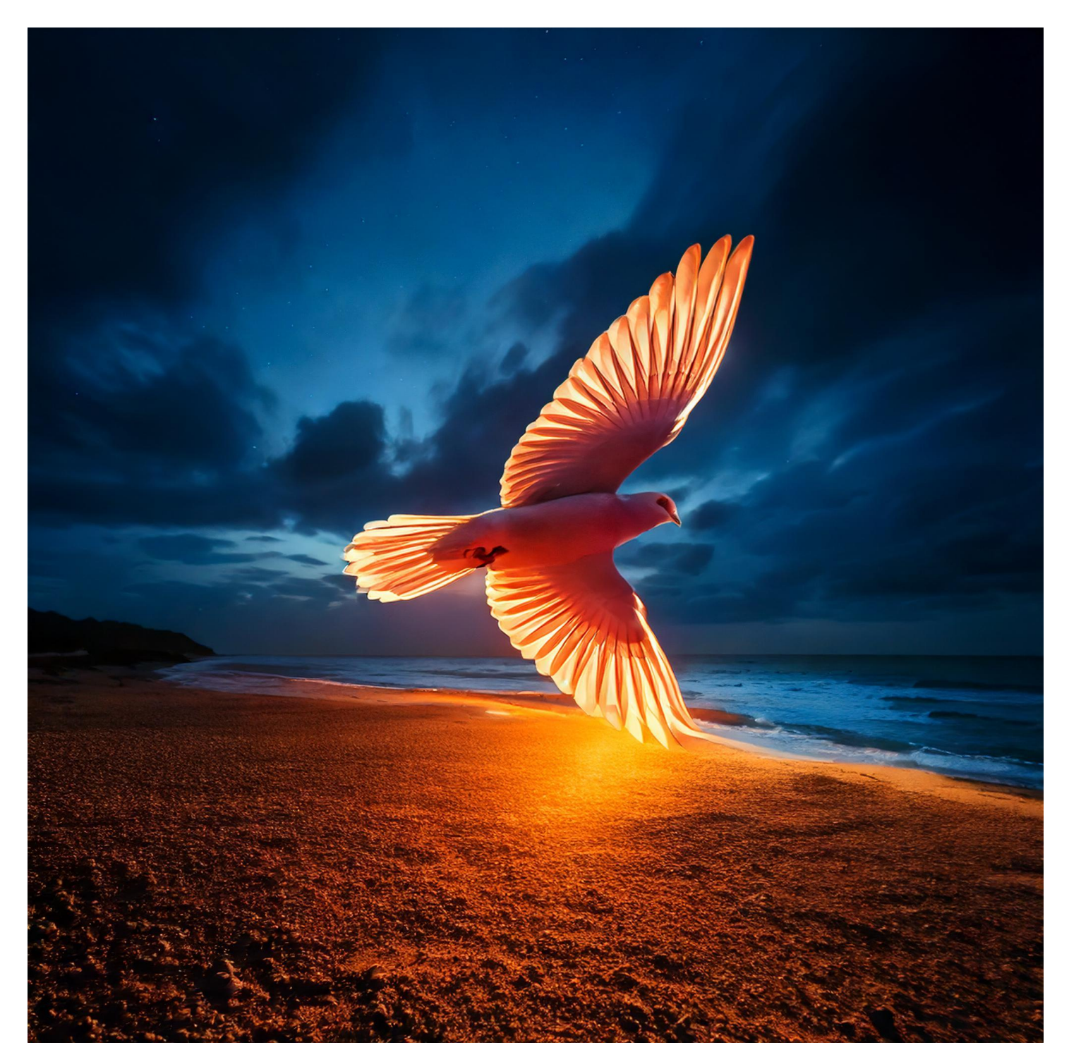
The land appearing amidst the seas, still under the dark cloud cover

And God said, "Let the water under the sky be gathered to one place, and let dry ground appear." And it was so. God called the dry ground "land," and the gathered waters he called "seas." And God saw that it was good.