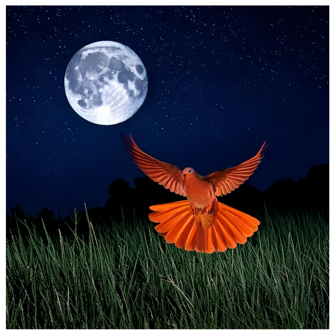
The moon - the lesser light - appears to govern the night, along with the stars

God set them in the vault of the sky to give light on the earth, to govern the day and the night, and to separate light from darkness. And God saw that it was good. And there was evening, and there was morning—the fourth day .