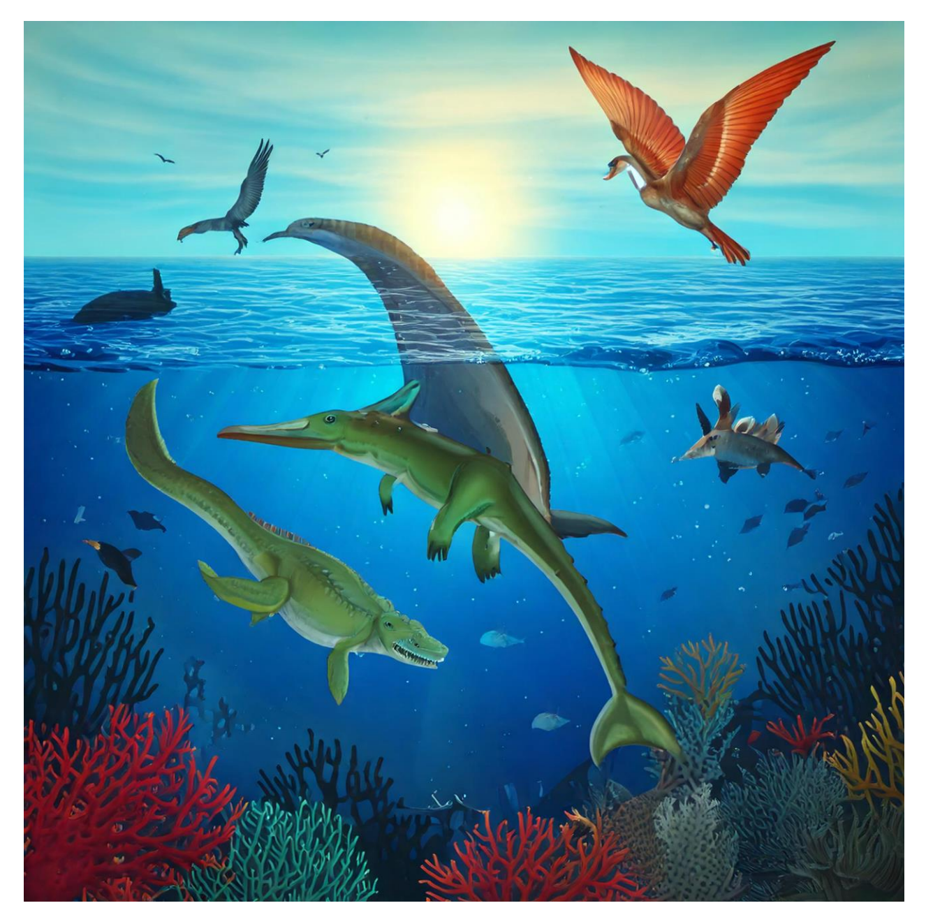
The creation of fish, dinosaurs (the predecessor of birds), and birds

And God said, "Let the water teem with living creatures, and let birds fly above the earth across the vault of the sky." So God created the great creatures of the sea and every living thing with which the water teems and that moves about in it, according to their kinds, and every winged bird according to its kind. And God saw that it was good. God blessed them and said, "Be fruitful and increase in number and fill the water in the seas, and let the birds increase on the earth." And there was evening, and there was morning—the fifth day .