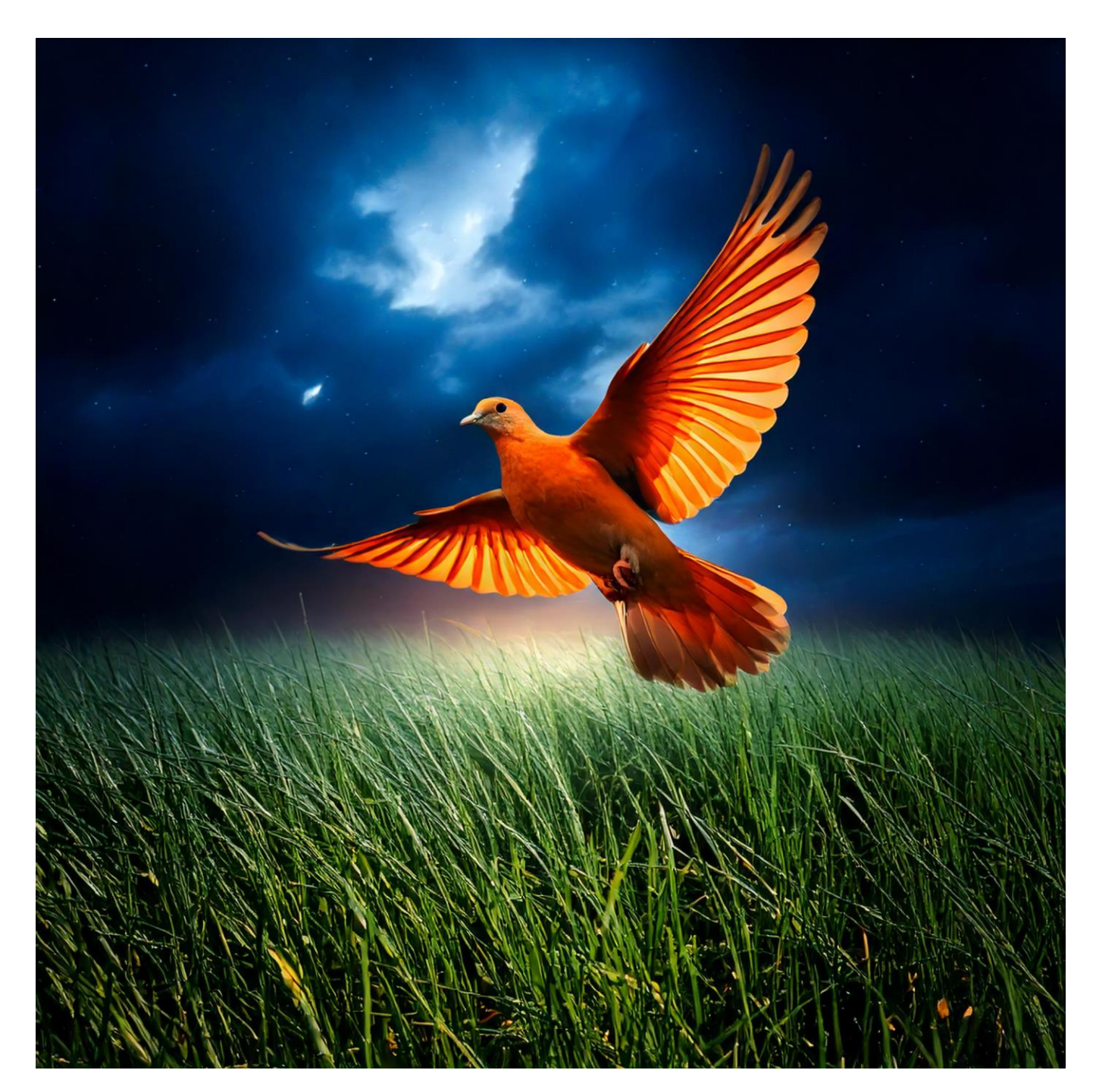
The land producing vegetation

Then God said, "Let the land produce vegetation: seed-bearing plants and trees on the land that bear fruit with seed in it, according to their various kinds." And it was so. The land produced vegetation: plants bearing seed according to their kinds and trees bearing fruit with seed in it according to their kinds. And God saw that it was good. And there was evening, and there was morning—the third day .