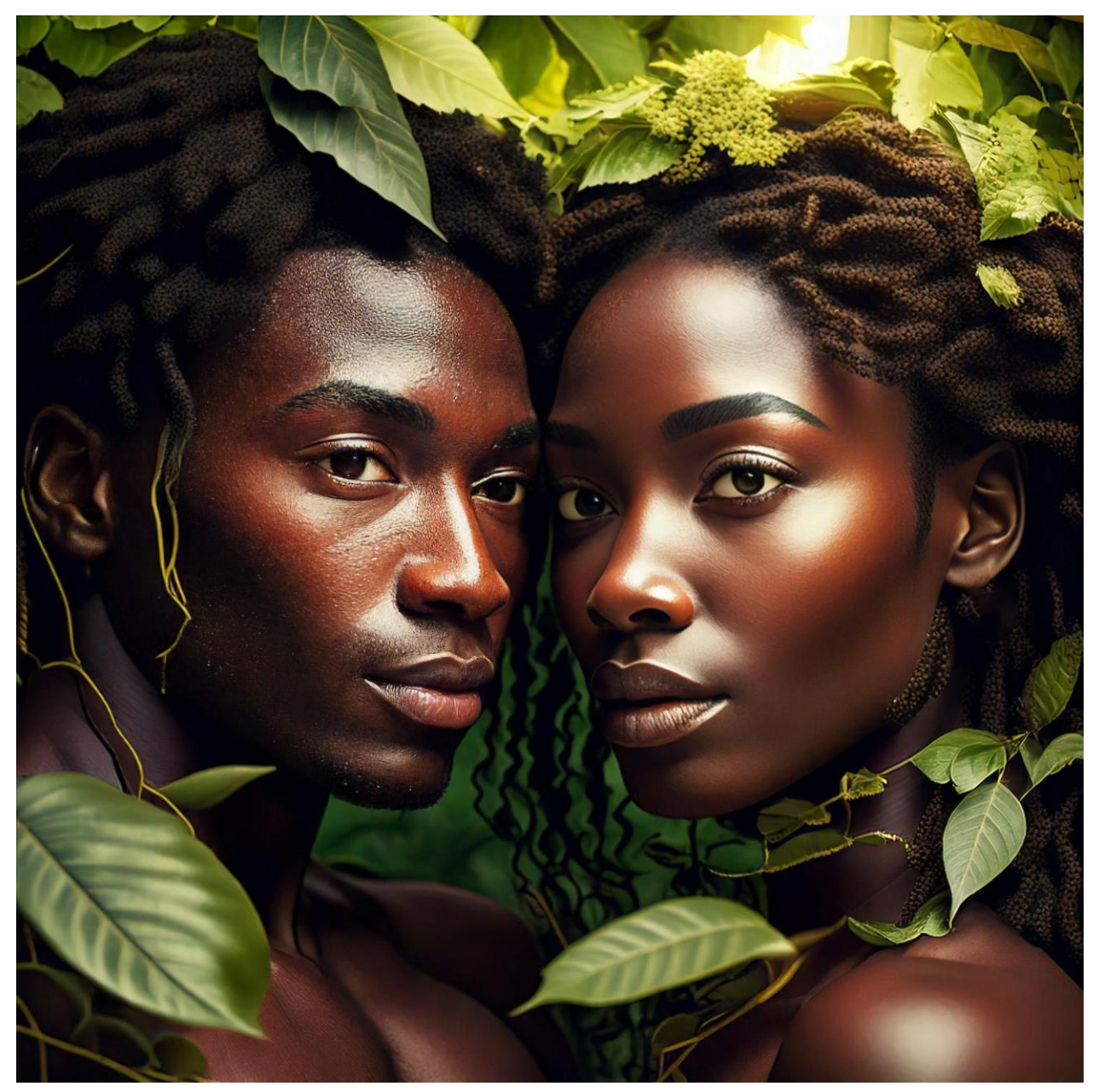
God creates man and woman in His own image

So God created mankind in his own image, in the image of God he created them; male and female he created them.