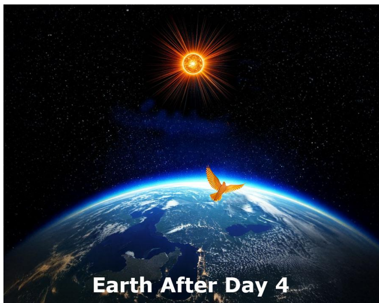
Earth After Day 4

From the Point of View near the Surface of the Earth, then the Spirit of God (Symbolized as a Dove) Would See the Sky Differently Because of Cloud Cover